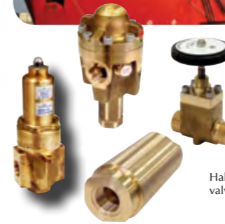
Hale Hamilton valves, regulators, filters, relief valves and manifolds fitted to the skid