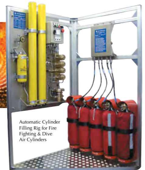
Automatic Cylinder Filling Rig for Fire Fighting & Dive Air Cylinders